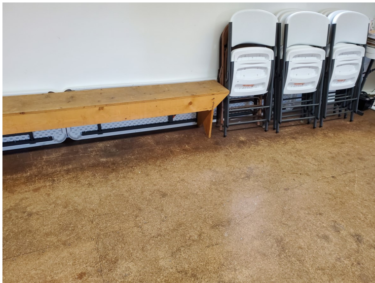
This is the original subfloor installed in 1961. Time for an upgrade!

Total projected cost of the re-flooring project is around $12,000. This should cover purchase and installation of quality vinyl plank flooring. Assuming we get the entire grant of $6,000 and add $3,000 of our own, that will still leave us at least $3k short of what we'll ultimately need. We will be scrambling, but we should be optimistic that it will all come together. There may be other grants to supplement the Washington Foundation grant. By next summer we should have our beautiful new flooring in the Grange hall, which will make it even more attractive for more functions.