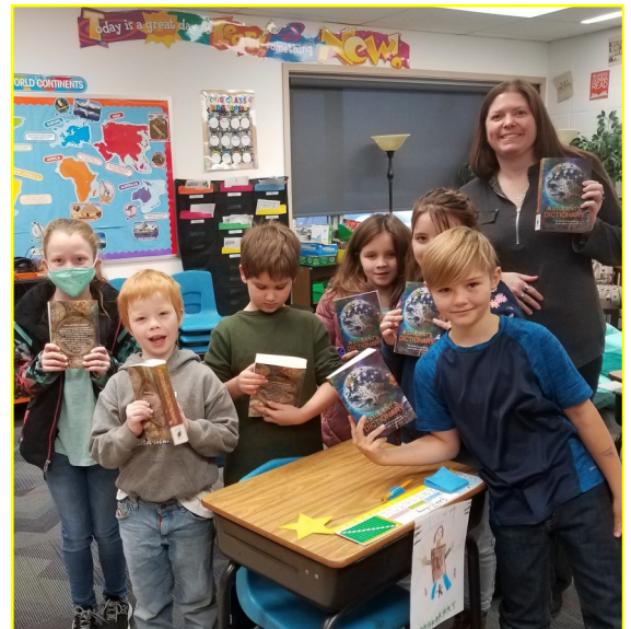
The Trout Creek third-graders were thrilled to receive their dictionaries.

The books were enthusiastically received by the children at all venues.