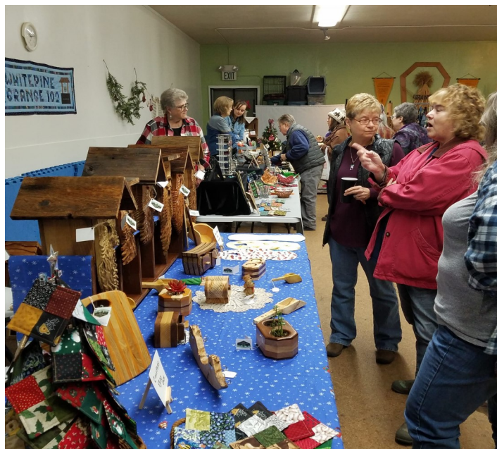
The Craft Bazaar on Nov. 20 was a huge hit. Crafters are already planning another fair for next fall at Whitepine Grange.