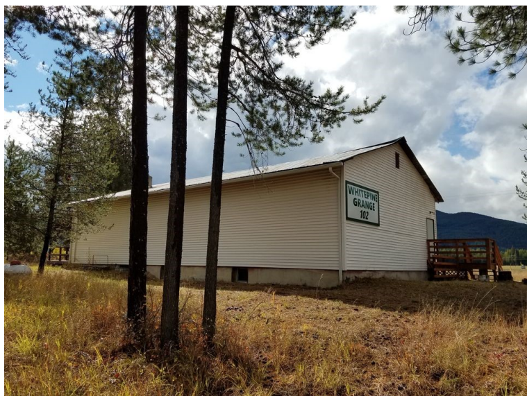
Above: Whitepine Grange will be getting a new roof very soon, thanks to the generosity of donors from our area.

The Grange , officially named The National Grange of the Order of Patrons of Husbandry , is a fraternal organization in the United States that encourages families to band together to promote the economic and political well-being of the community and agriculture. Whitepine Grange #102 is still fulfilling that obligation! Join us! Dues are just $30 per year. Whitepine Grange 102 P.O. Box 1313 Trout Creek, MT 59874