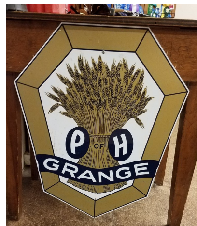
Right: The Grange emblem now hangs in a prominent position on the walls of the main hall as a reminder of the Grange's original purpose.