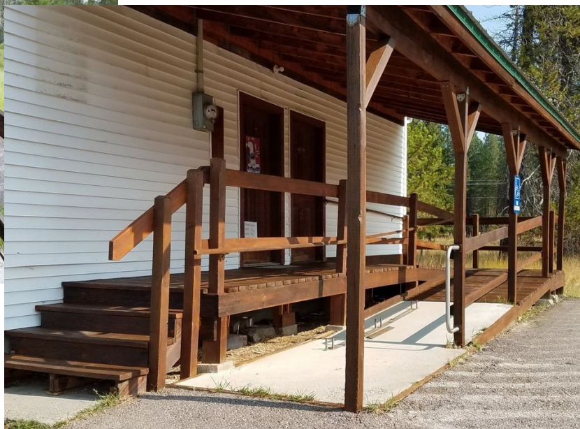
Below: the repaired front porch with new railings and a fresh coat of stain, complements of volunteer Carrie Greene and crew.