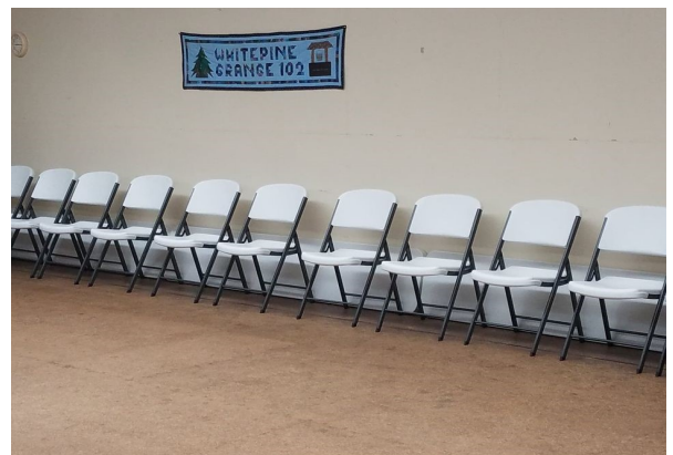
Right: New chairs and lightweight tables have replaced the old theater chairs and broken banquet tables.