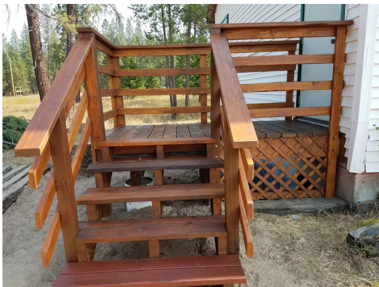
Below: Their finished project, a new and safer back porch.