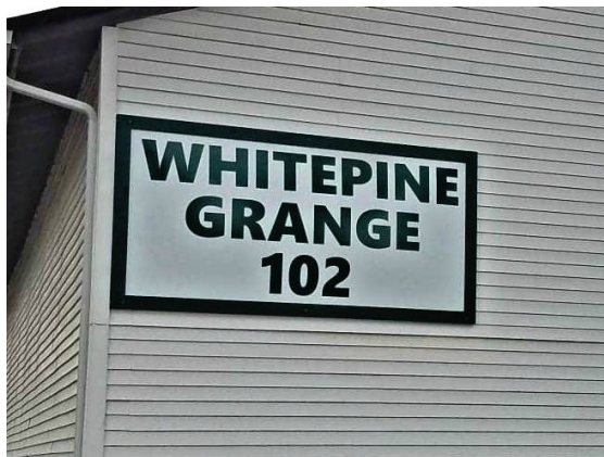
Above: A large, bright sign now makes the Grange more visible from the highway.