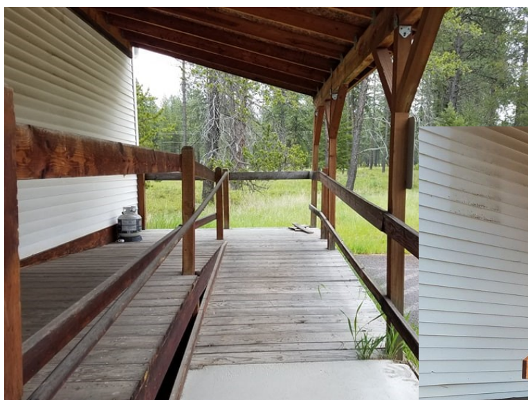
Left: the old front porch with broken railings.