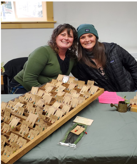
Two of last year's happy craft exhibitors

Previous years' vendors included glass blowers, jewelry makers, soap and candles, unique birdhouses, denim tote bags, wooden toys, quilting and much more.