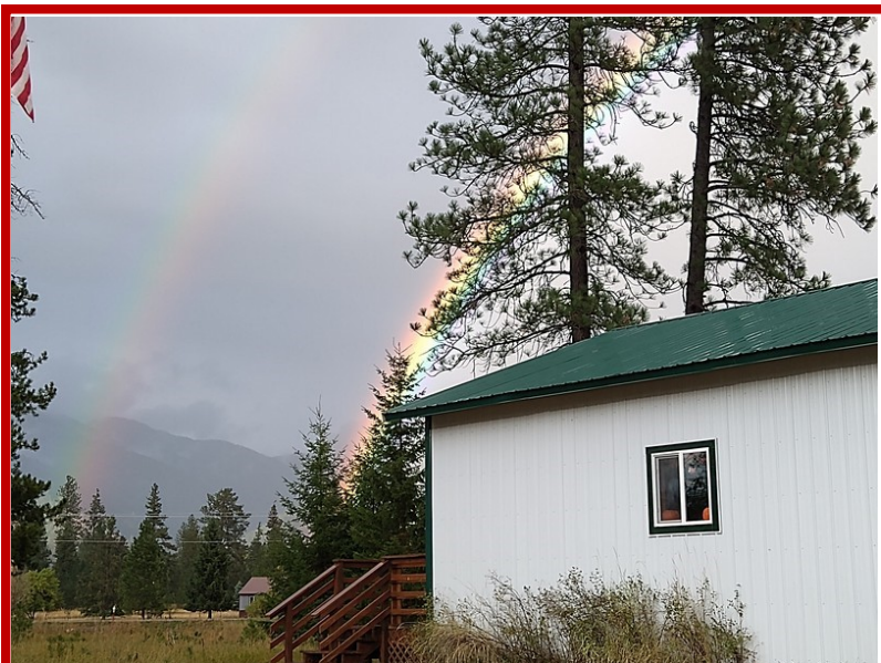
A double rainbow crowns Whitepine Grange on a recent fall evening.