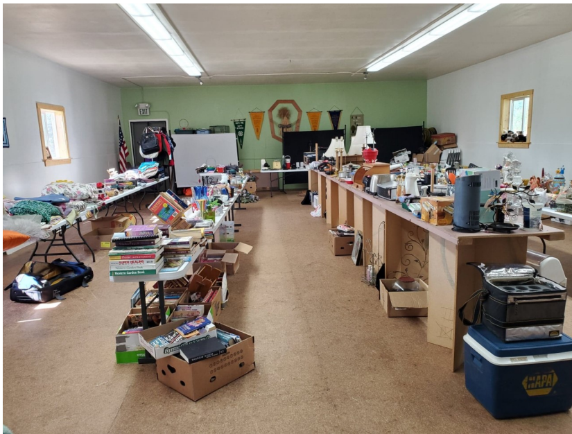
A full house and a full front yard...donors graced us with plenty of good merchandise, indoors and out, for the Grange's June yard sale.

The county turns out to help us exceed expectations