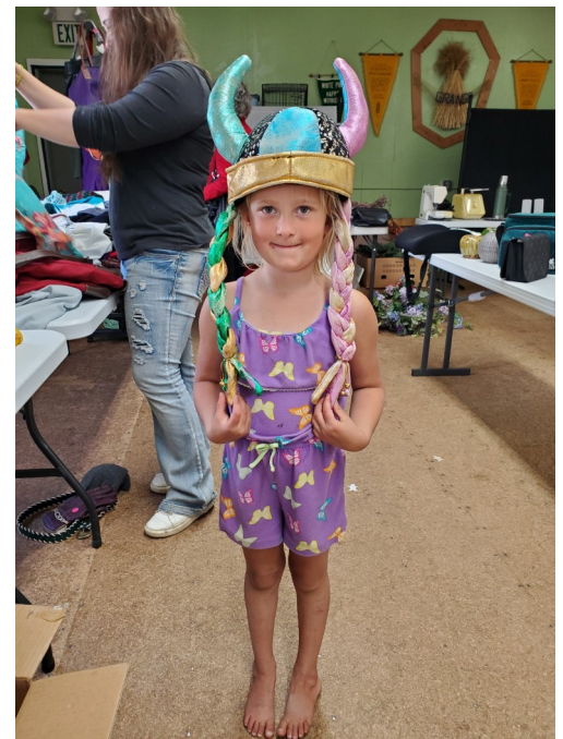
You never know what you'll find at a yard sale. This young customer discovered and modeled a Viking helmet with long braids.

Whitepine Grange held its big yard sale June 24-25, in cooperation with Sanders County Yard Sale-ing weekend.